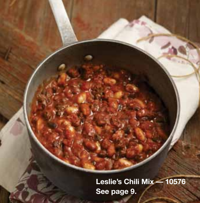
Leslie's Chili Mix — 10576 See page 9.