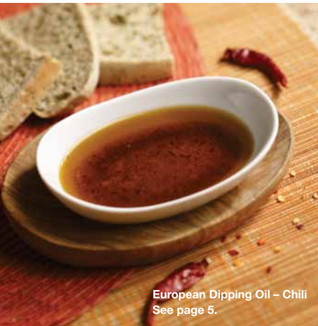
European Dipping Oil – Chili See page 5.